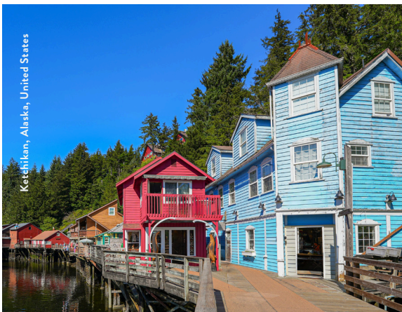
Ketchikan, Alaska, United States

Land Tour descriptions and highlights begin on page 20.