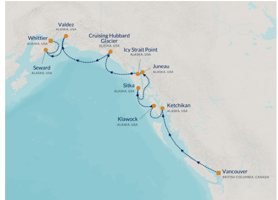
ALL MAPS ATTRIBUTED TO MAPBOX©