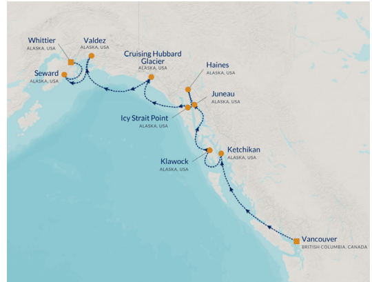
ALL MAPS ATTRIBUTED TO MAPBOX©