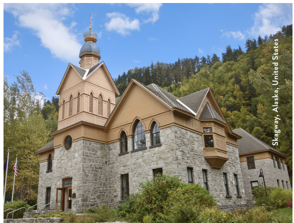
Skagway, Alaska, United States