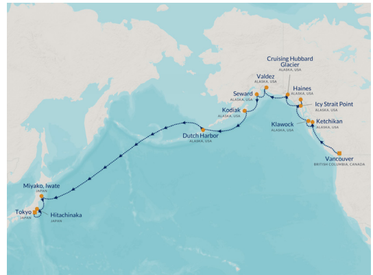
ALL MAPS ATTRIBUTED TO MAPBOX®