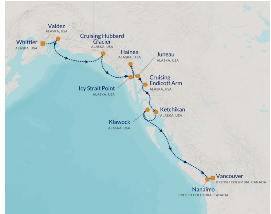
ALL MAPS ATTRIBUTED TO MAPBOX©