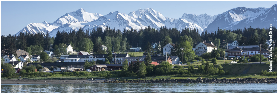
Haines, Alaska, United States

Land Tour descriptions and highlights begin on page 20.