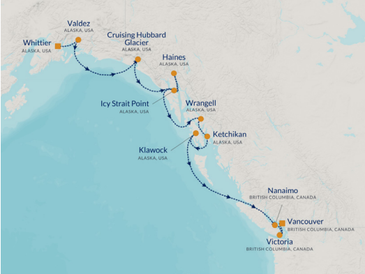
ALL MAPS ATTRIBUTED TO MAPBOX©